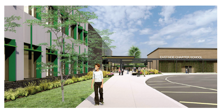
Artist rendition, Eastside Charter STEM Hub, Entry Approach

EastSide leaders also spearheaded the establishment of the REACH Riverside Purpose Built Communities holistic neighborhood revitalization that is ongoing in Riverside. This investment in the community is leading to new